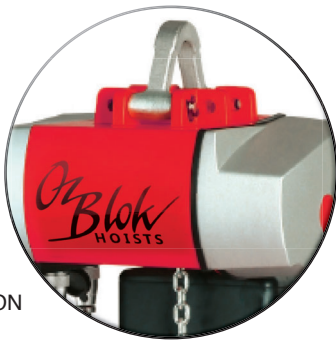
HANGER SUSPENSION OPTIONAL