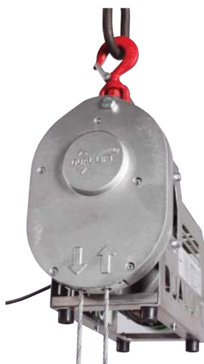
UpLite Cargo Hoist