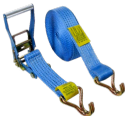
Double J Hooks